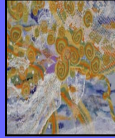
Jitka Lesakova- Manousakis 2009 Best in Show