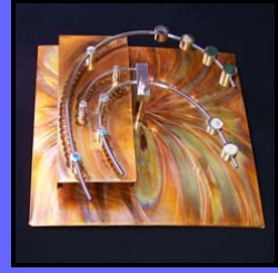
Royal Miree 2009 People's Choice Award